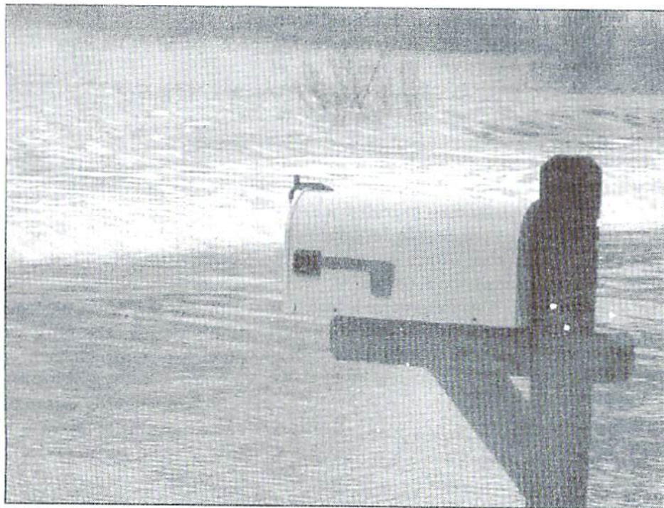
"Neither rain, snow or dark of night will keep the post office from delivering the mail..."